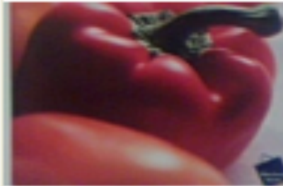
poster of capsicum